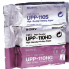
Print Media: UPP-110S/5 (Standard media), UPP-110HD (High density media), UPP-110HG (Premium high-gloss media)